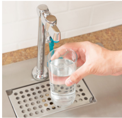
Includes a 8" filler faucet, along with a drip pan and a removable grate.